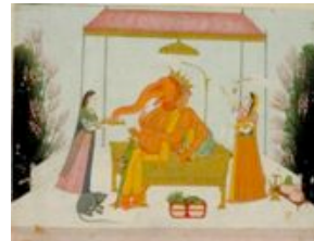
books about Buddha