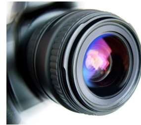
P _ _ t _ gr _ phy