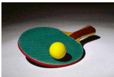
T _ b _ e T _ n _ is