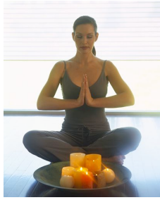
Y _ g a