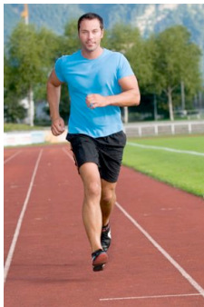
R _ n _ ing