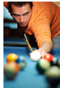
P _ _ l