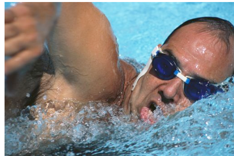
Sw _ _ m _ _ _