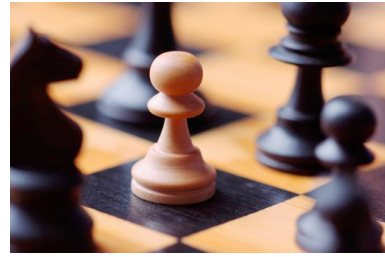
C _ e _ s